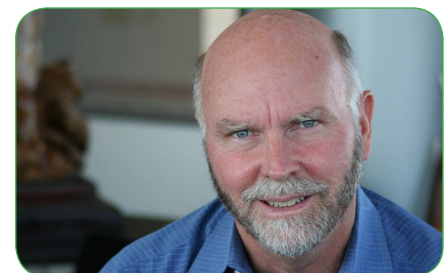
Founder J. Craig Ventner has also founded Diversa Corporation, Celera Genomics, and Human Genome Sciences

Synthetic Genomics aims to engineer environmentally useful organisms from minimal synthetic chromosomes